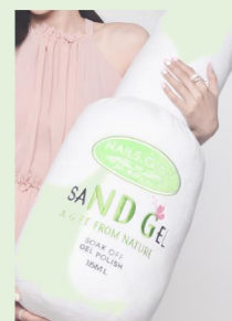
SANDGEL STUFF TOY

PLEASE ASK OUR CASHIER FOR MORE DETAILS.