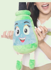
NAILEE STUFF TOY